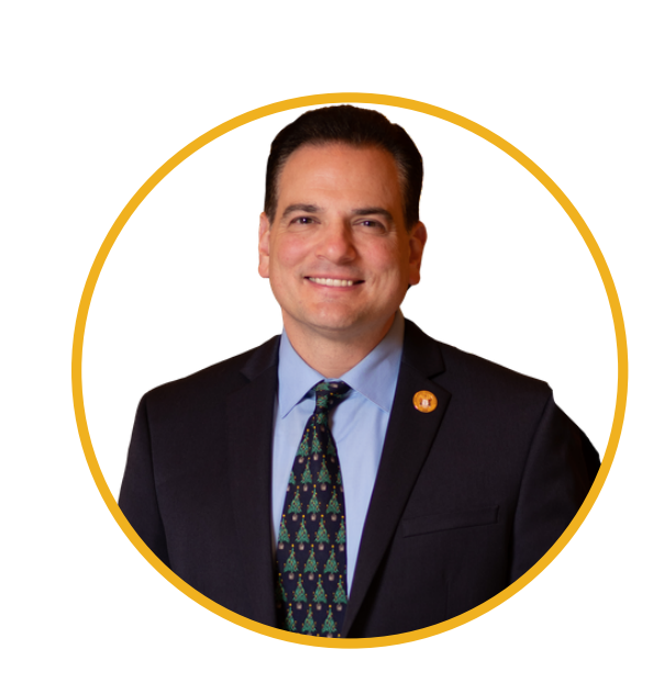
Nicholas Scutari New Jersey State Senator