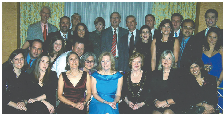
The character and quality of our people, from our founders (pictured above) and through the years, form the cornerstones of our mission and reputation.